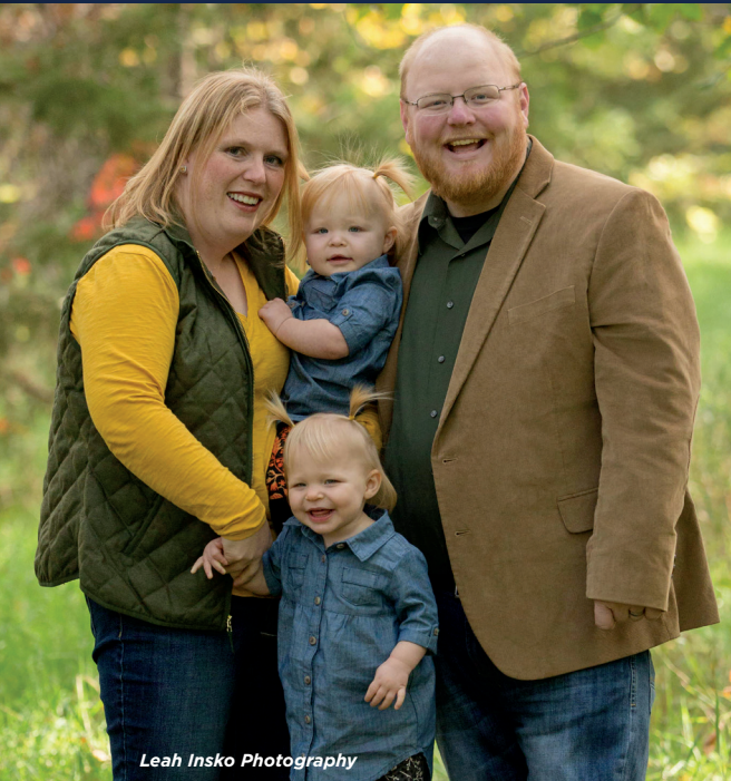
Leah Insko Photography

CONGRATULATIONS to Brooke Swier Schloss for being named as one of Prairie Business magazine’s “Top 25 Women in Business” winners for 2018!!!!